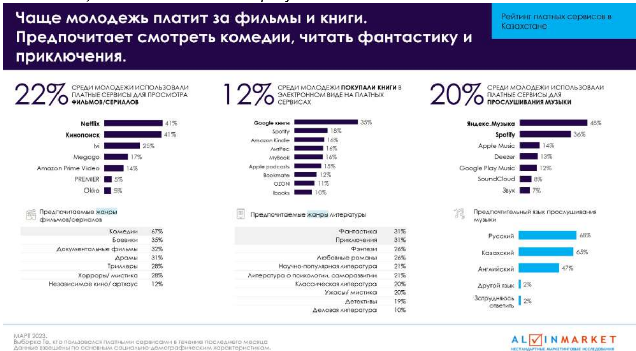
Slide from the presentation of Natalia Ospanova's speech at the CAF business conference. Rating of paid services in Kazakhstan

"In general, we see that young people are already mature enough to pay for the content they consume. According to the survey results, only 37% of young people in Kazakhstan do not use paid content. For the rest of the young population of the country, films and music are in the first place in the number of purchases: these are some kind of subscriptions, platforms that "hook" users on a monthly fee and charge it monthly. If we talk about resources with video content in Kazakhstan, the popular platforms NETFLIX and Kinopoisk are the two undisputed leaders with an equal share of coverage of 41%. In the ranking of e-book stores, Google has 35%, Spotify music platform has 36%, and Yandex.Music music platform has 48%.