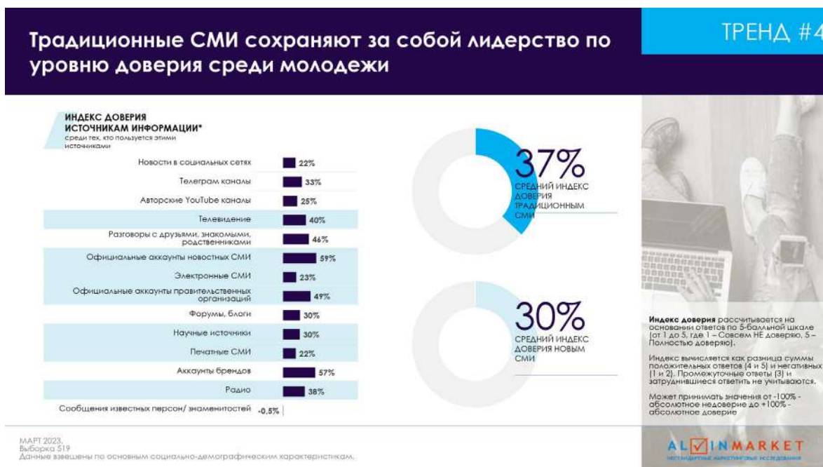
Slide from the presentation of Natalia Ospanova's speech at the CAF business conference. Trend No. 4 Traditional media leads in terms of trust

At the same time, according to experts, young people in Kazakhstan have different levels of trust in sources of information. Thus, despite the fact that new types of media are more popular among young people, traditional ones retain the highest level of trust. Young people lean towards official sources of information.