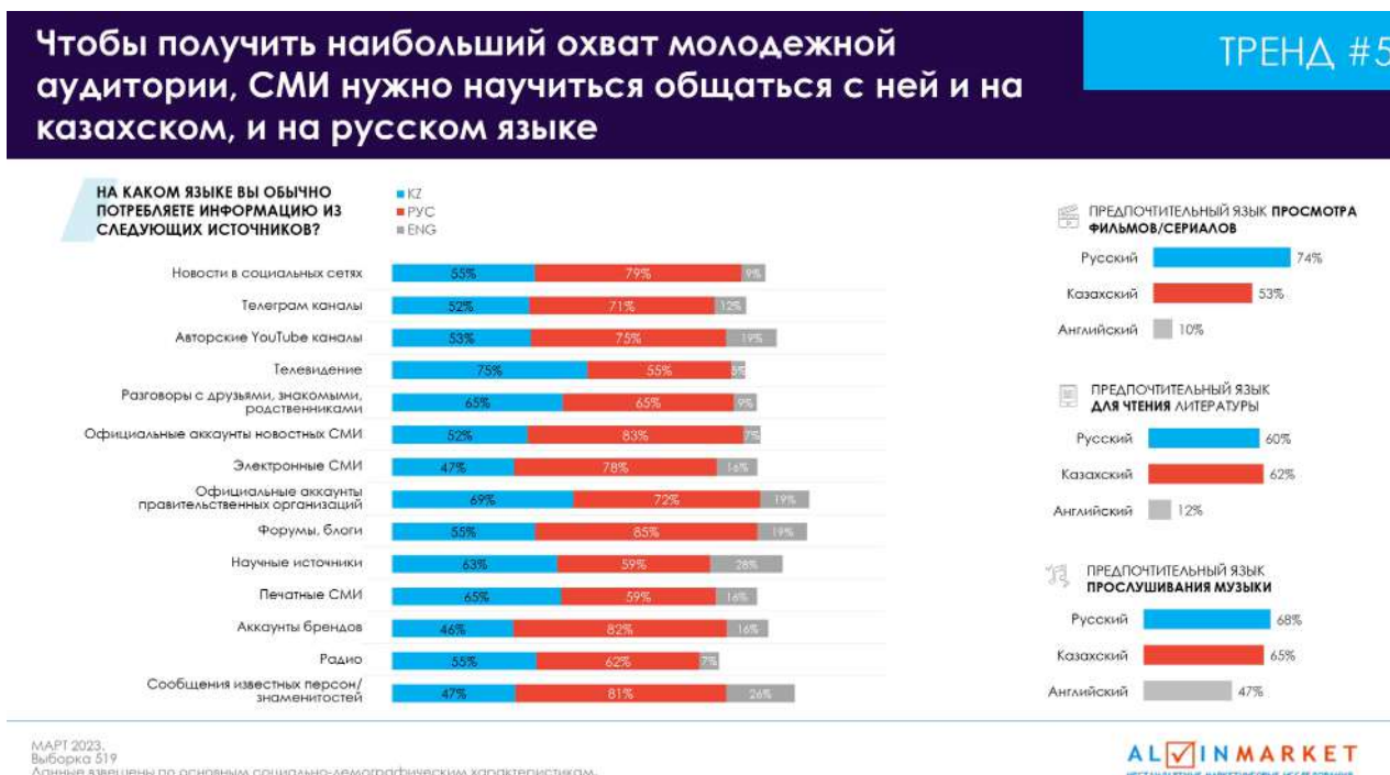
Slide from the presentation of Natalia Ospanova's speech at the CAF business conference. Trend No. 5 in media consumption by young people in Kazakhstan

Among the top five media consumption trends, Natalia Ospanova, the expert, also singled out the language of communication with the audience. "It is no longer possible to communicate with young people in only one language. It should be taken into account that young Kazakhstanis actively consume content in both Kazakh and Russian. We need to approach them as bilinguals and actively reach out to all groups of the target audience," Natalia Ospanova, the speaker of the CAF business conference, recommends.